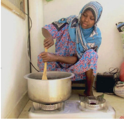
Zanzibar, woman cooking using the Cleancook stove.